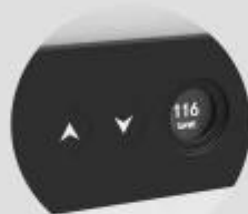
Round display screen display screen display height 620-1170mm / can choose 24.4-50.0 inches(without desktop)