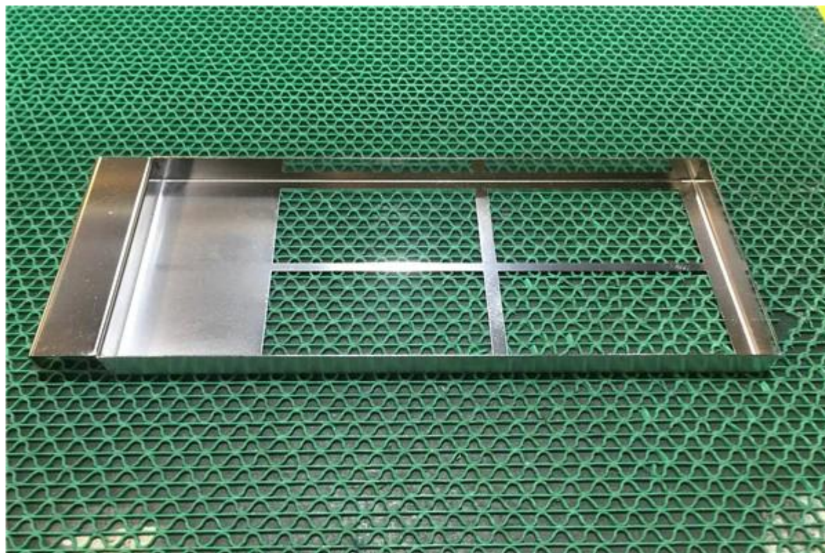
Imagem do produto