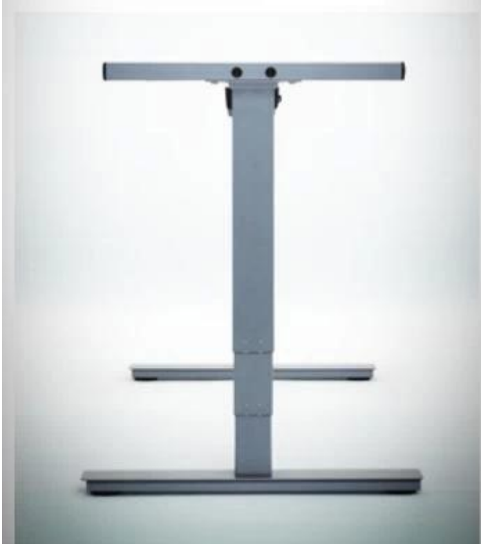
Height range: 620-1270 mm