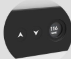
Round display screen display screen

display height 620-1170mm / can choose 24.4-50.0 inches(without desktop)