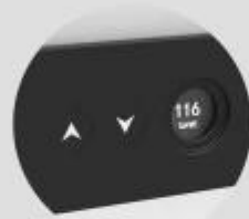
Round display screen