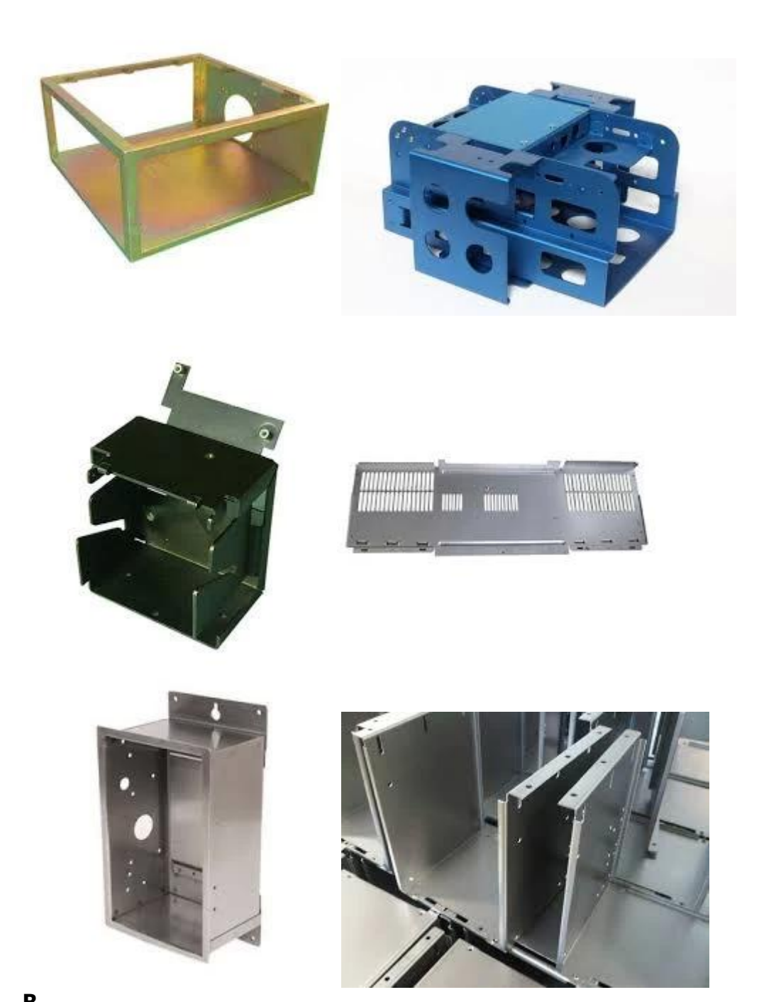
Workmanship for manufacturing

Stainless steel, iron (SPCC, SECC, SPTE, tinplate), aluminum alloy, red copper, brass, bronze alloy are available.