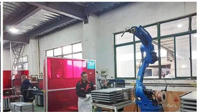
Robot Welding Machine