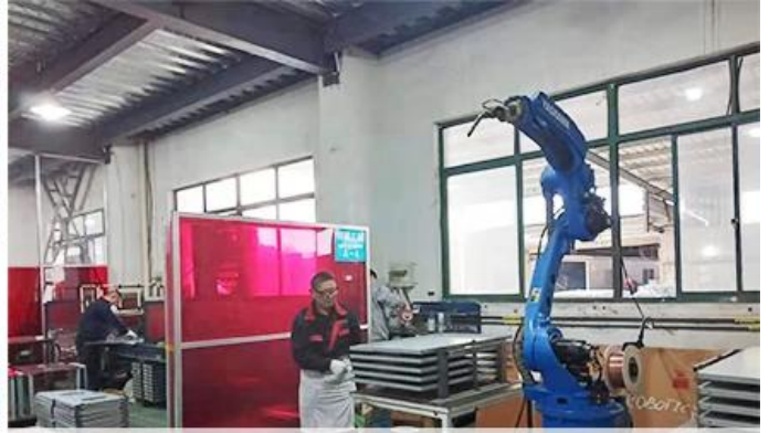
Robot Welding Machine