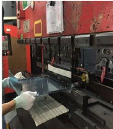
5. Bending again