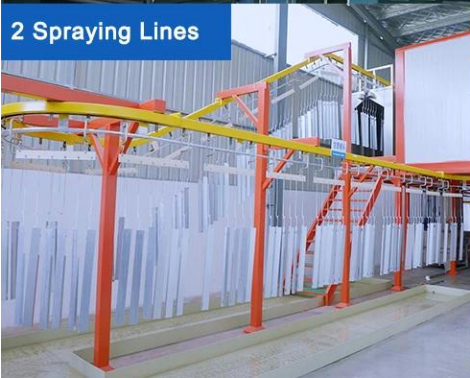
2 Spraying Lines