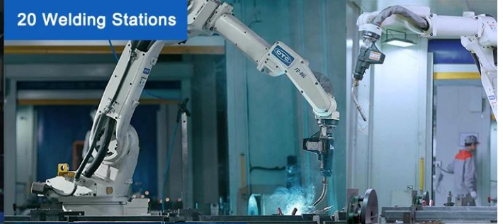
20 Welding Stations