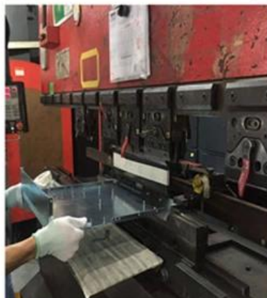
5. Bending again