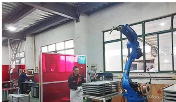
Robot Welding Machine