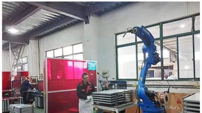
Robot Welding Machine