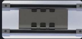
Control box installation: Plug type Patent design,It is more convenient