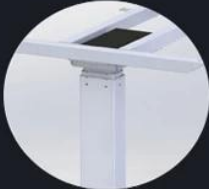
Out Tube size can be 90mmX60mm