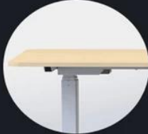
Motor metal case Ultra-thin design