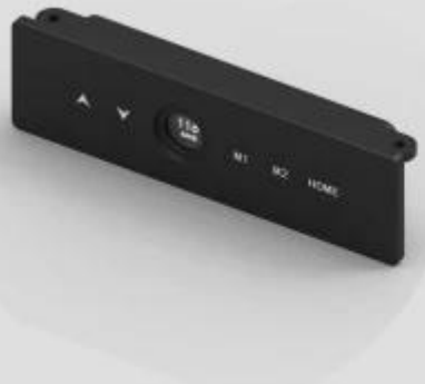
Mounting holes on the side , easy to fix