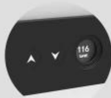
Round display screen display screen display height 620-1170mm / can choose 24.4-50.0 inches(without desktop)