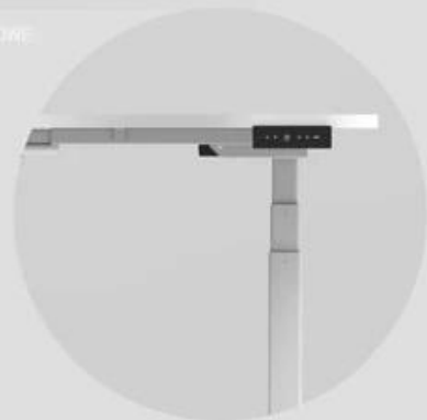
display height 620-1170mm / can choose 24.4-50.0 inches(without desktop)