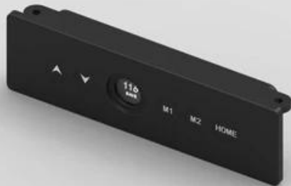
Mounting holes on the side , easy to fix