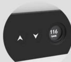
Round display screen display screen