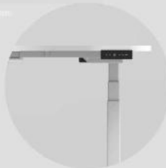
display height 620-1170mm / can choose 24.4-50.0 inches(without desktop)