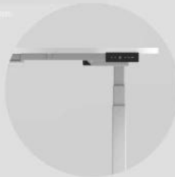
Round display screen display screen display height 620-1170mm / can choose 24.4-50.0 inches(without desktop)