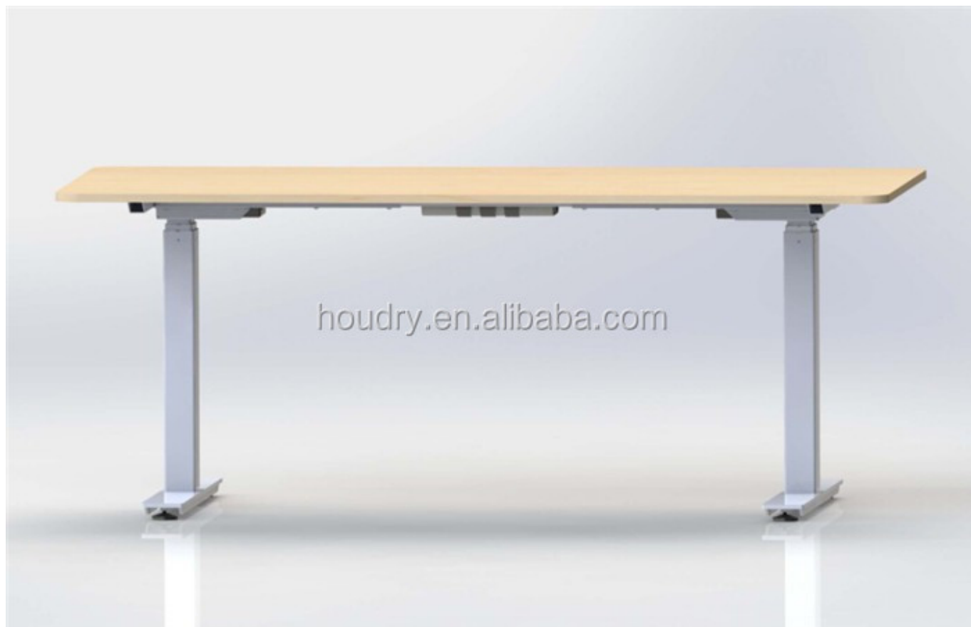
Photo of adjustable