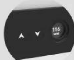
Round display screen display screen display height 620-1170mm / can choose 24.4-50.0 inches(without desktop)