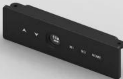
Mounting holes on the side , easy to fix