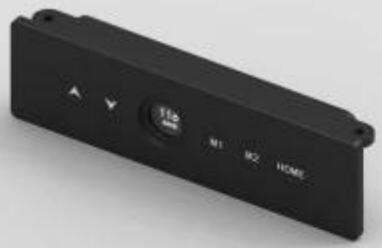
Mounting holes on the side , easy to fix