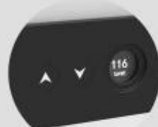
Round display screen display screen display height 620-1170mm / can choose 24.4-50.0 inches(without desktop)