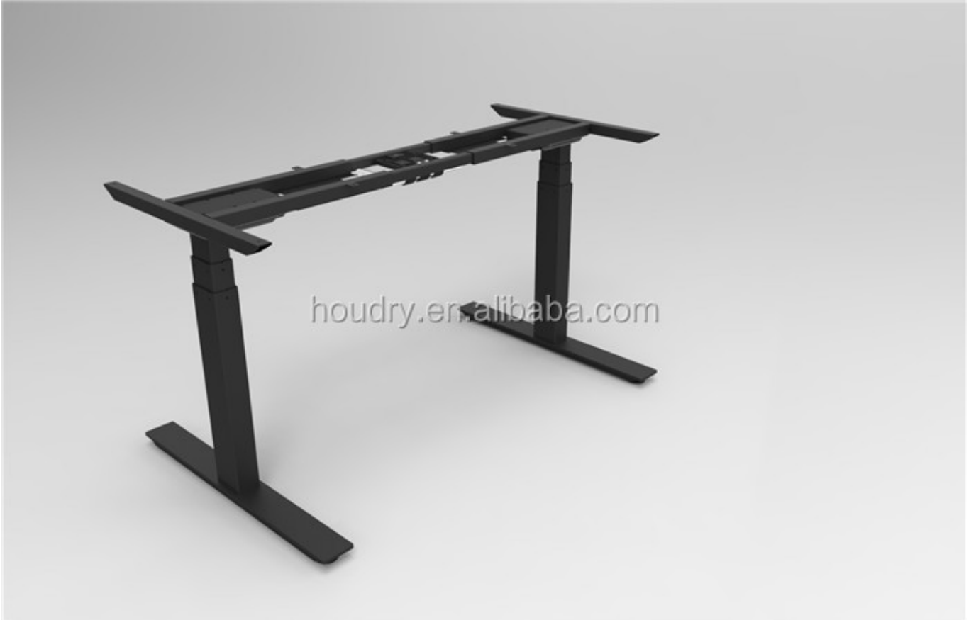
2 legs / 2 motors / 3 Column segments with CE certificated Super mute motor synchronization control system