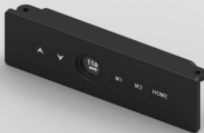
Mounting holes on the side , easy to fix