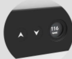
Round display screen display screen display height 620-1170mm / can choose 24.4-50.0 inches(without desktop)