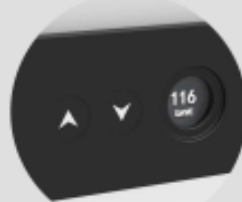
Round display screen display screen display height 620-1170mm / can choose 24.4-50.0 inches(without desktop)