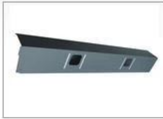
Industrial printer housing