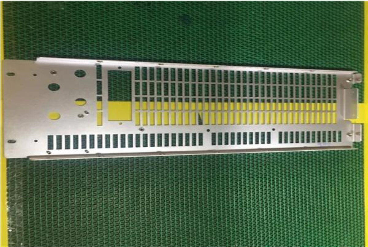
La nostra fabbrica