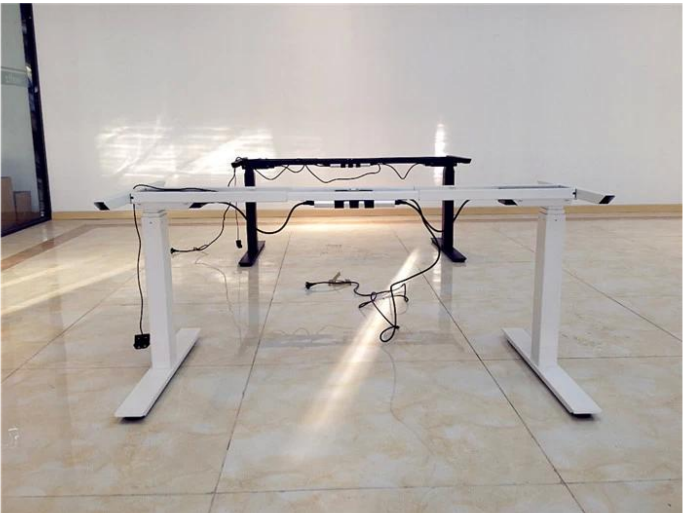
The parts of adjustable desk