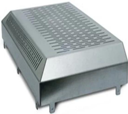
Immagine del prodotto