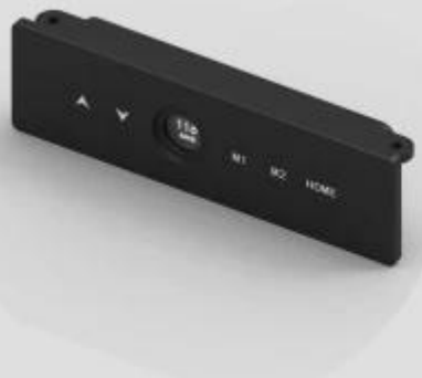
Mounting holes on the side , easy to fix