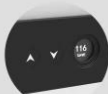
Round display screen