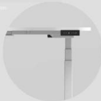
display height 620-1170mm / can choose 24.4-50.0 inches(without desktop)