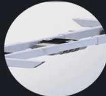
Control box patent design, Ultra-thin, small Switching power supply Metal case, have qualitative feeling