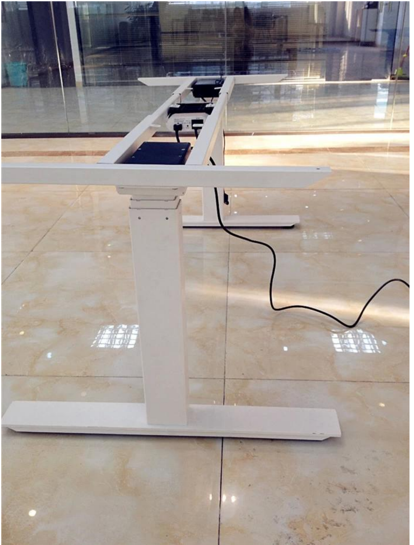
The parts of adjustable desk