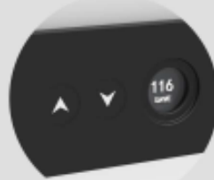
Round display screen display screen display height 620-1170mm / can choose 24.4-50.0 inches(without desktop)