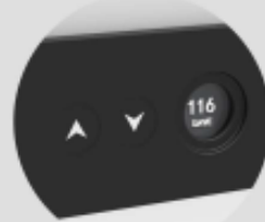
Round display screen display screen display height 620-1170mm / can choose 24.4-50.0 inches(without desktop)