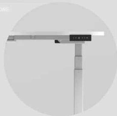
display height 620-1170mm / can choose 24.4-50.0 inches(without desktop)