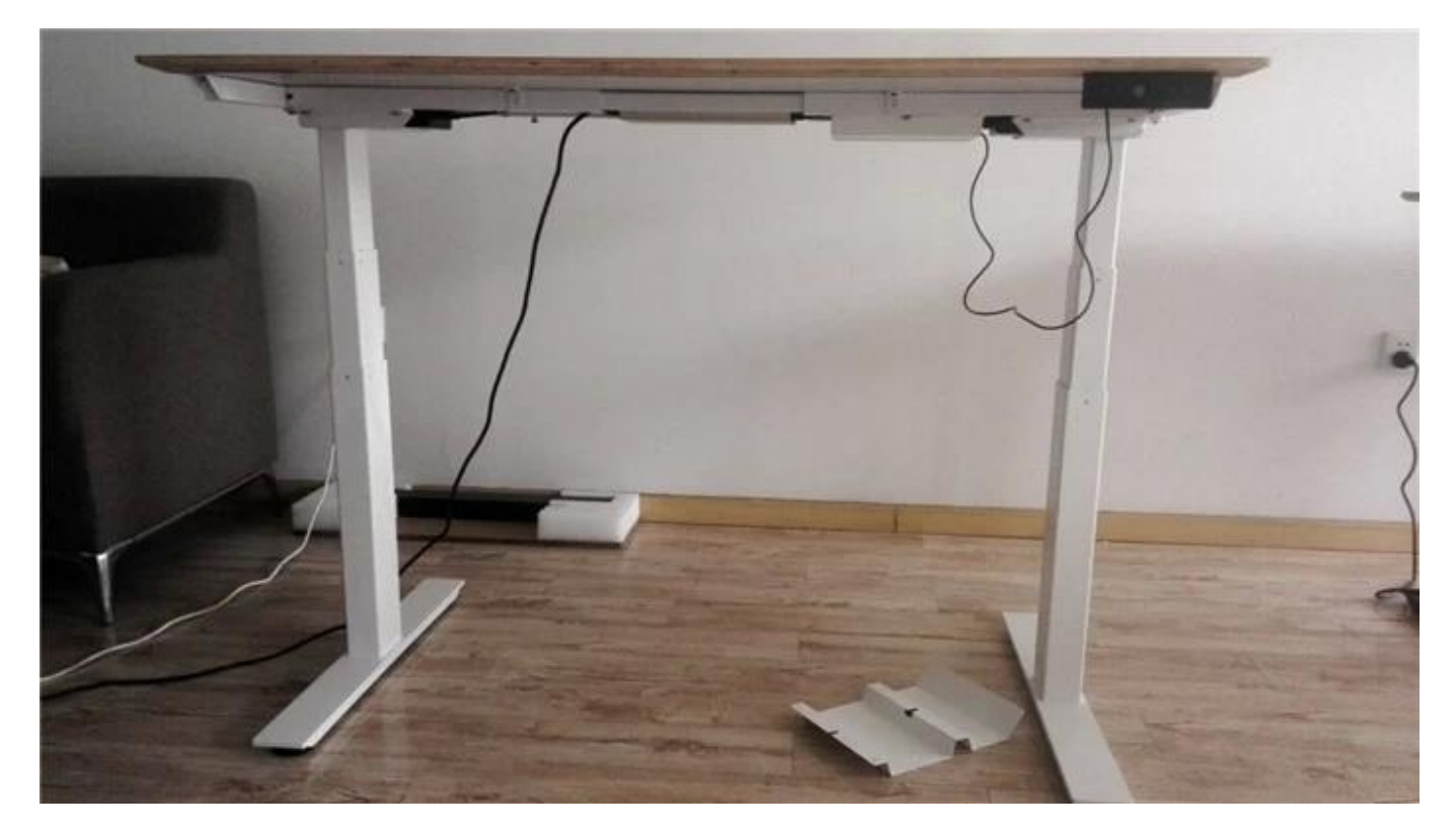
One set in one carton The carton size is 108 × 32 × 22 Centimeters