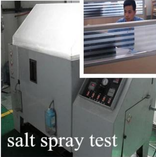
salt spray test