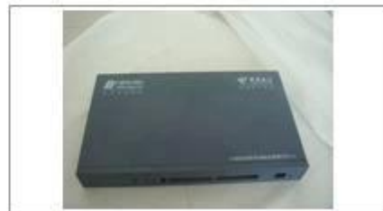
China Telecom custom gateway