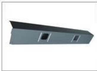
Industrial printer housing