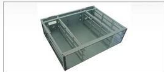
Internal structure of the server chassis