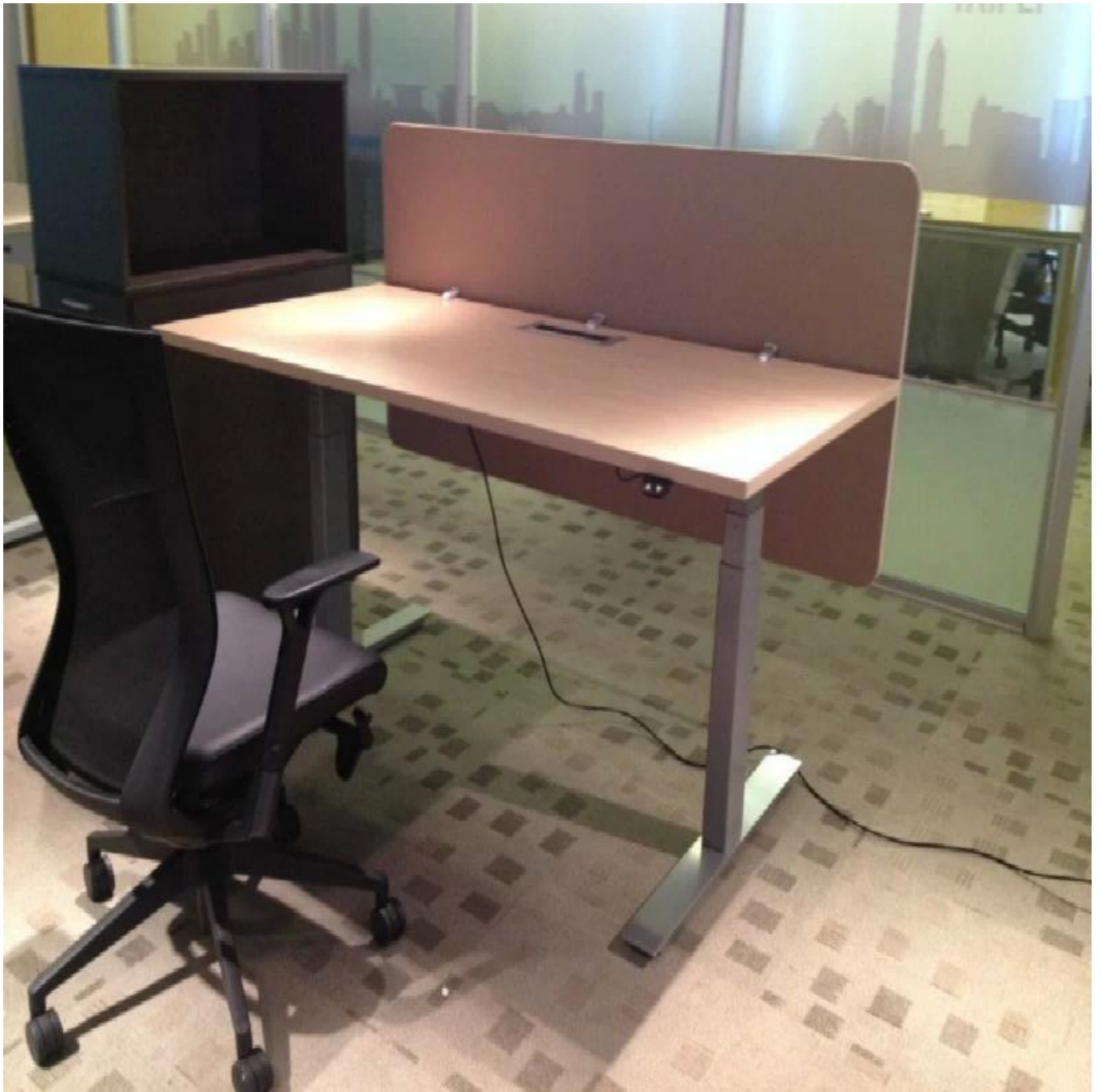
The parts of adjustable desk